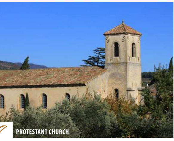
7 PROTESTANT CHURCH