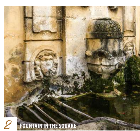
2 FOUNTAIN IN THE SQUARE