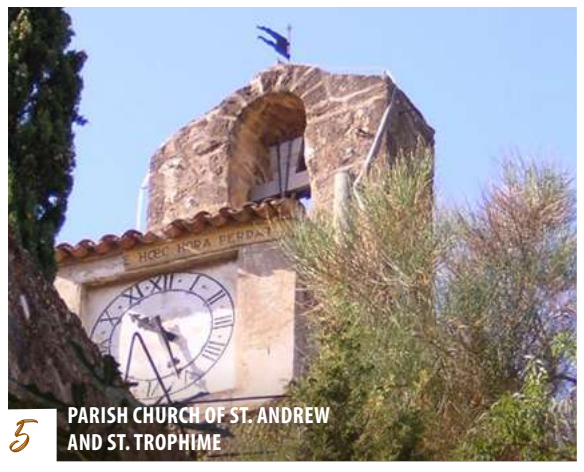
5 PARISH CHURCH OF ST. ANDREW AND ST. TROPHIME