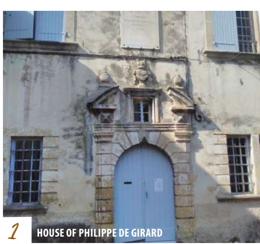
1 HOUSE OF PHILIPPE DE GIRARD

PERCHED ON A SMALL HILL, LOURMARIN IS ONE OF FRANCE'S MOST BEAUTIFUL VILLAGES. ITS SILHOUETTE IS BROKEN BY THREE TOWERS - THE BELFRY, THE CATHOLIC CHURCH AND THE 'TEMPLE' OR PROTESTANT CHURCH - TOGETHER WITH A JUMBLE OF NARROW STREETS THAT ENCIRCLE THE HEART OF THE VILLAGE. THE SMART BOUTIQUES, GALLERIES AND RESTAURANTS OF TODAY SHOWCASE THE FINE CHARACTERFUL PROPERTIES THAT HAVE BEEN WITNESS TO LOURMARIN'S LONG HISTORY. AND THEN THERE IS THE CHÂTEAU, OPEN ALL YEAR ROUND, WHICH WAS PROVENCE'S FIRST RENAISSANCE CASTLE. ALBERT CAMUS AND HENRI BOSCO, TWO NOTABLE WRITERS WHO SUCCEEDED TO LOURMARIN'S CHARMS, HAVE ALSO CONTRIBUTED TO THE VILLAGE'S FAME.