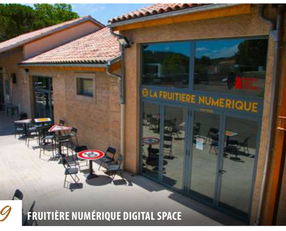
9 FRUITIÈRE NUMÉRIQUE DIGITAL SPACE