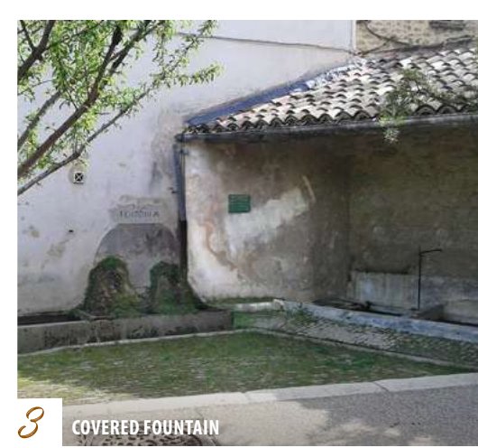
3 COVERED FOUNTAIN