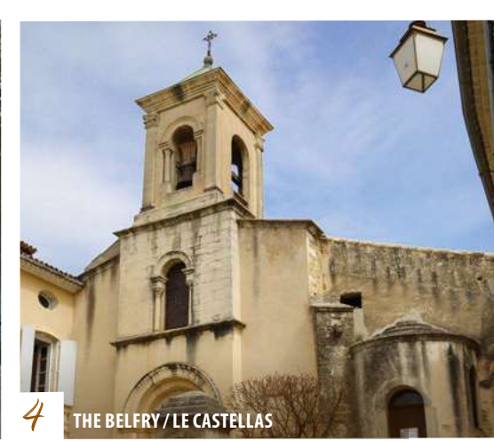
4 THE BELFRY / LE CASTELLAT