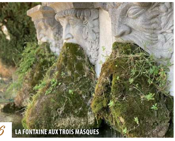
6 LA FONTAINE AUX TROIS MASQUES