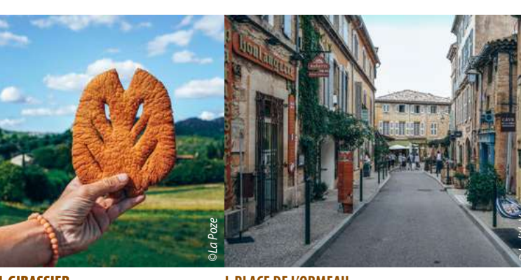
GIBASSIER PLACE DE L'ORMEAU